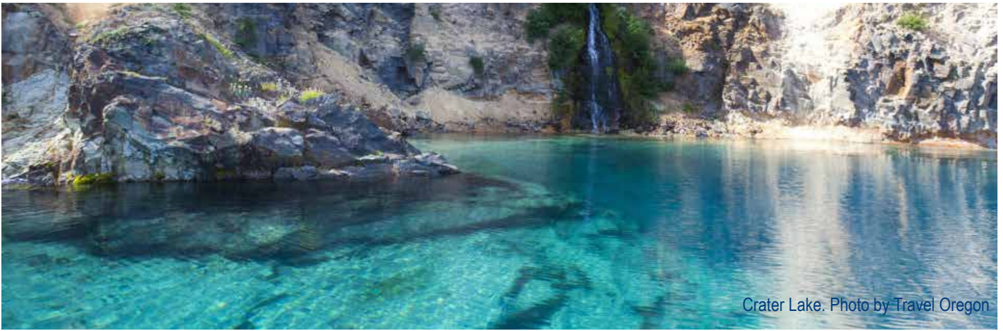
Crater Lake.