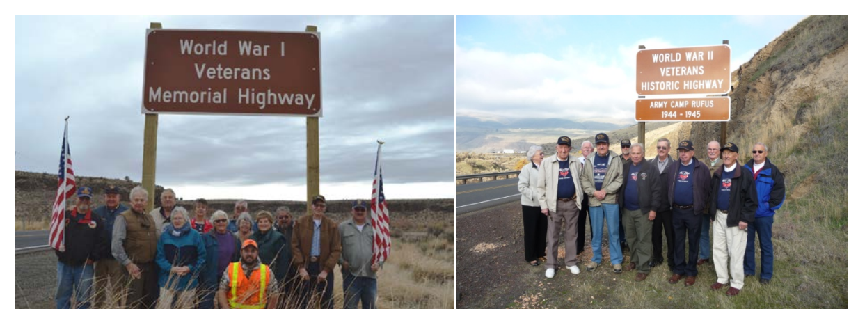
WWI Veterans Memorial Highway sign on US Hwy 395 near Burns 10 signs total