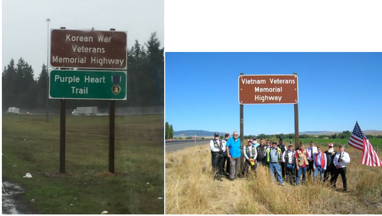
Korean War Veterans Memorial Highway and Purple Heart Trail signs on Interstate 5 near Tualatin 11 signs total