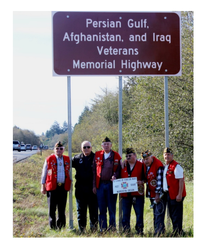
Persian Gulf, Afghanistan and Iraq Veterans Memorial Highway Sign on US Hwy 101 near Warrenton 11 signs total