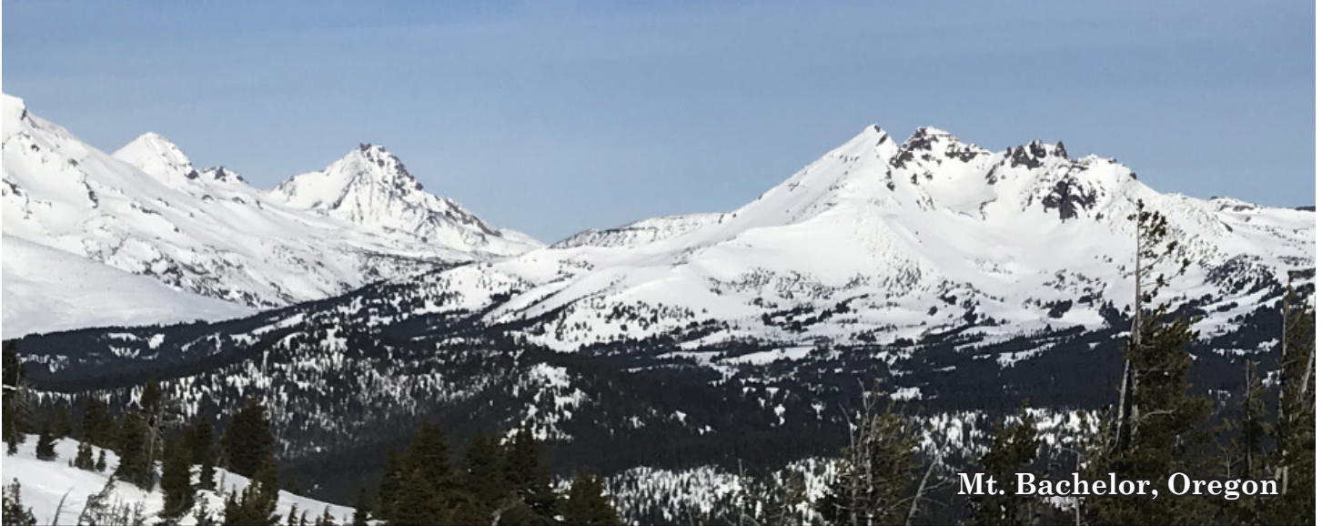
Mt. Bachelor, Oregon