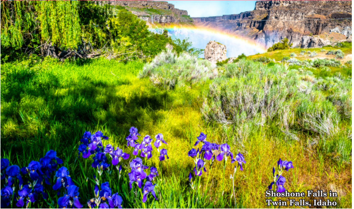
Shoshone Falls in Twin Falls, Idaho