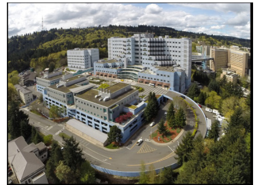
(Aerial View of Portland VA Medical Center)

The VA 21-22 can be revoked at any time, and an agent or attorney may be discharged at any time. Unless a claimant specifically indicates otherwise, the receipt of a new POA completed by the claimant shall constitute a cancellation of an existing one.