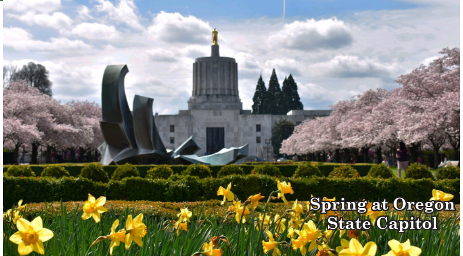
Spring at Oregon State Capitol